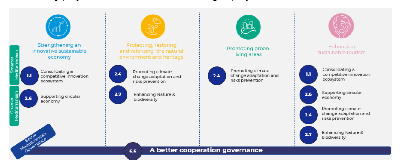
Illustration of the structure of the programme and types of projects: Priorities, Specific Objectives and Missions.

All the Thematic projects operating under each mission are supported by one Thematic community project and one Institutional Dialogue project.